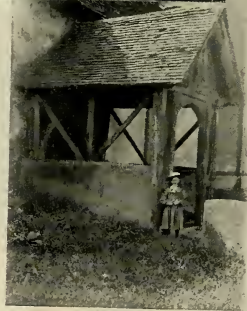
VIEWS SHOWING THE WEST PORCH AND INTERIOR OF ST. MARGARET'S CHURCH, TOPPESFIELD, ENGLAND.